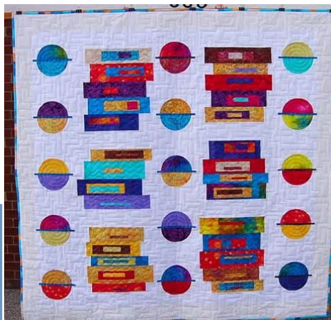
July Meeting—Modern Quilts!!